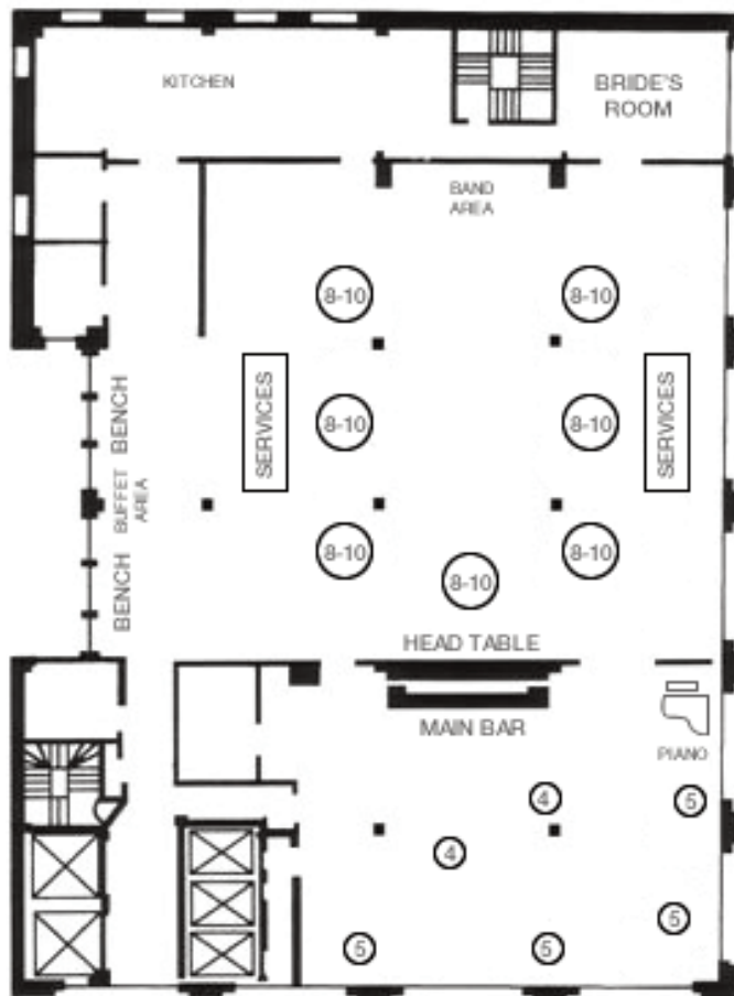
50 - 70+ GUESTS SEATED